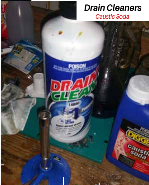
Drain Cleaners Caustic Soda