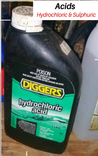
Acids Hydrochloric & Sulphuric