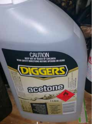
Acetone Nail Polish Remover