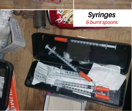
Syringes & burnt spoons