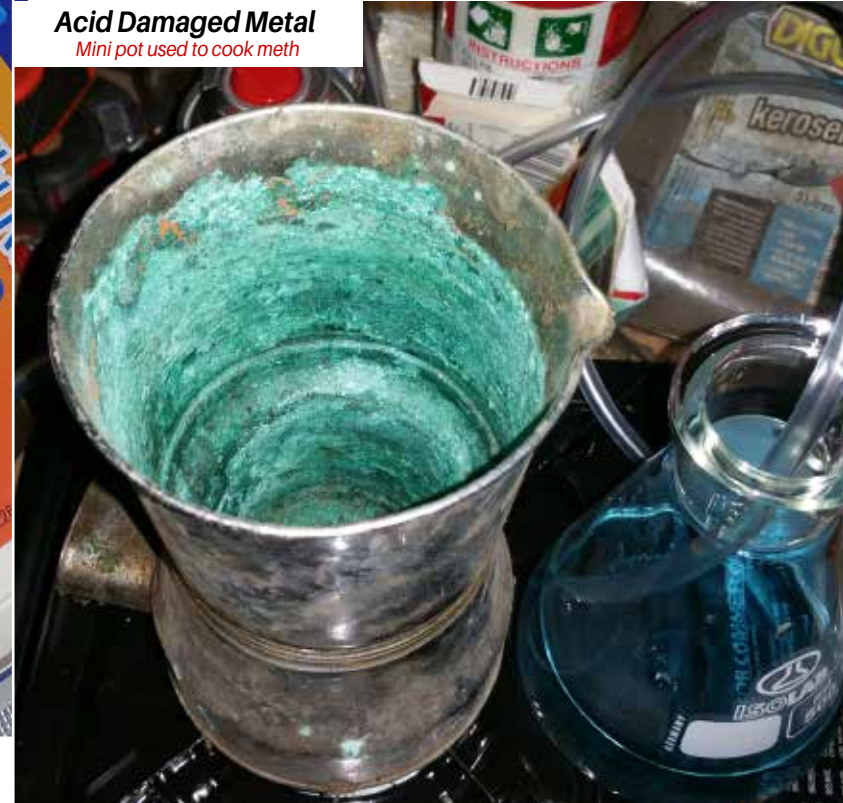
Acid Damaged Metal Mini pot used to cook meth