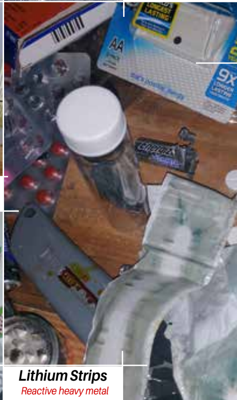
Lithium Strips Reactive heavy metal