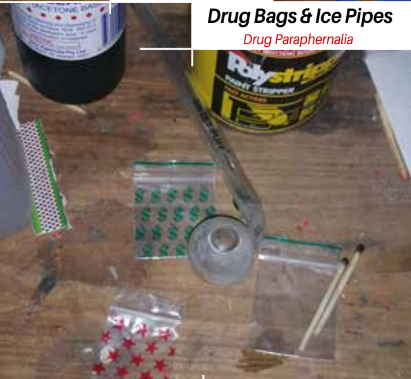
Drug Bags & Ice Pipes Drug Paraphernalia