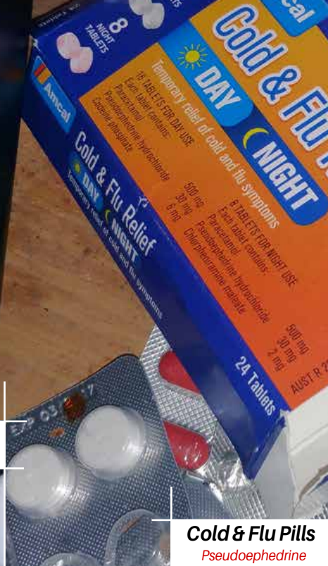
Cold & Flu Pills Pseudoephedrine