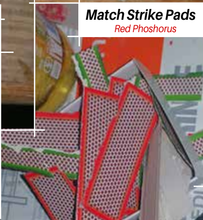
Match Strike Pads Red Phosphorus